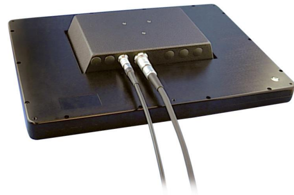
Pictured TOP: Standard DOD Series with Power and RGB Inputs.